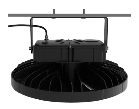
Step 2 - Use bolt to fix the bracket. (Figure B)